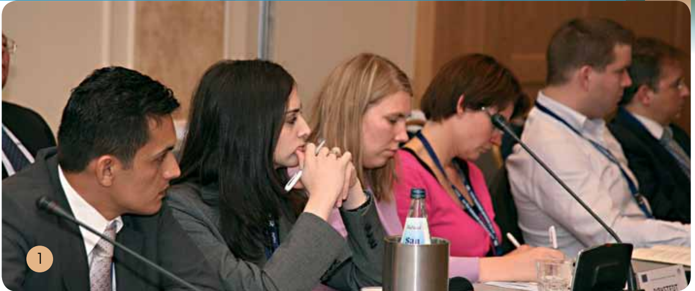
Photo 1: Participants at the Opening session of the XXVII EMS. Photo 2: Euro-Med diplomats participating in the Seminar Workshop.